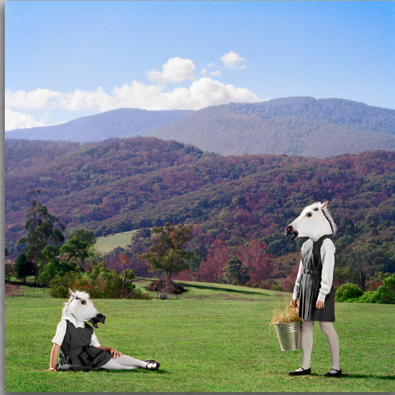
Polixeni Papapetrou The Provider 2009 pigment ink print, edition of 8, 105.0 x 105.0cm City of Darebin Art Collection