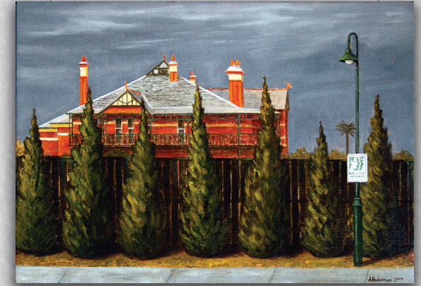
Adam Nudelman , Bundoora Homestead 2008 oil on linen, 25.0 x 40.0cm City of Darebin Art Collection